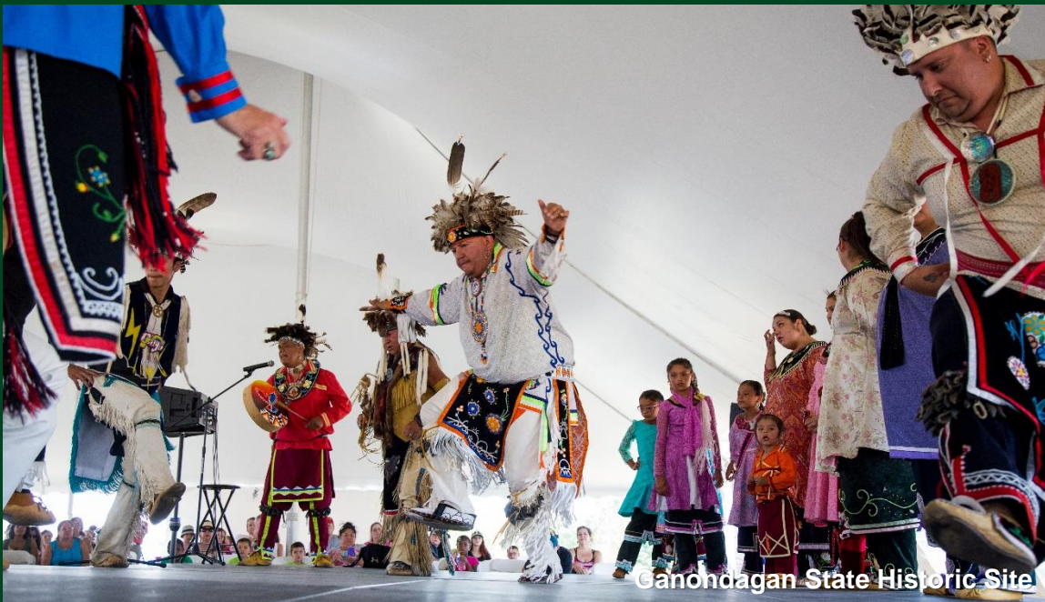
Canondagan State Historic Site