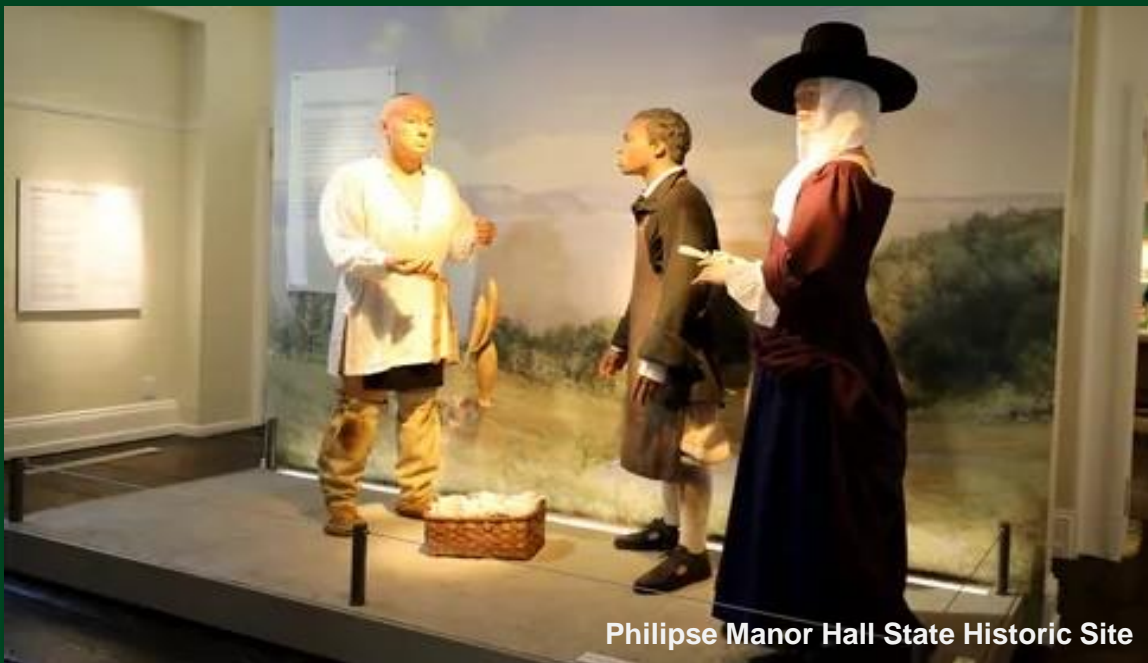
Philipse Manor Hall State Historic Site