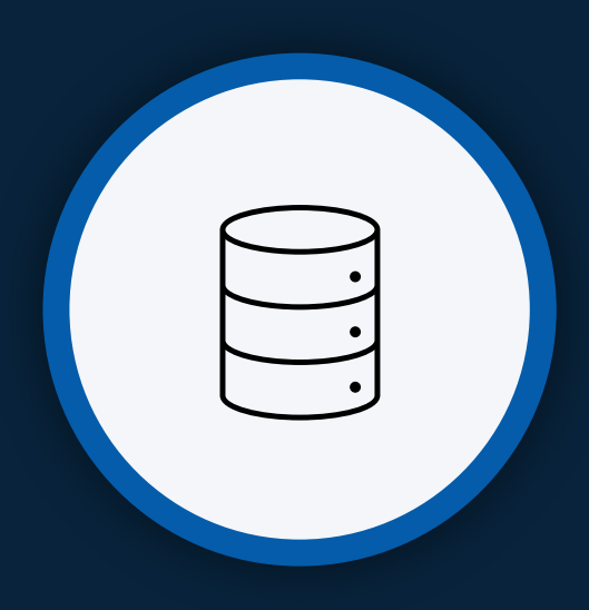
HSE Database Updated