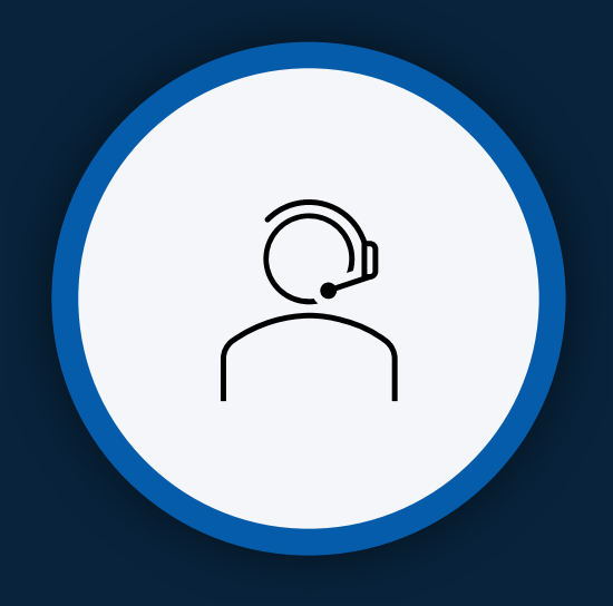
HSE Call Center