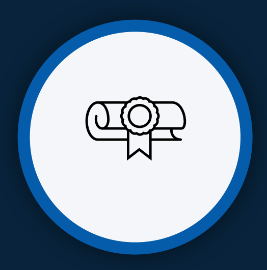
Request for Duplicate Transcripts and Diplomas