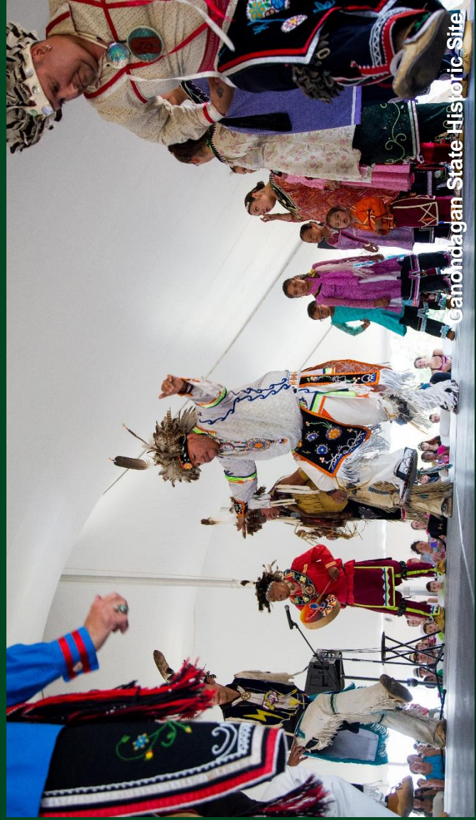
Cananogagan State Historic Site