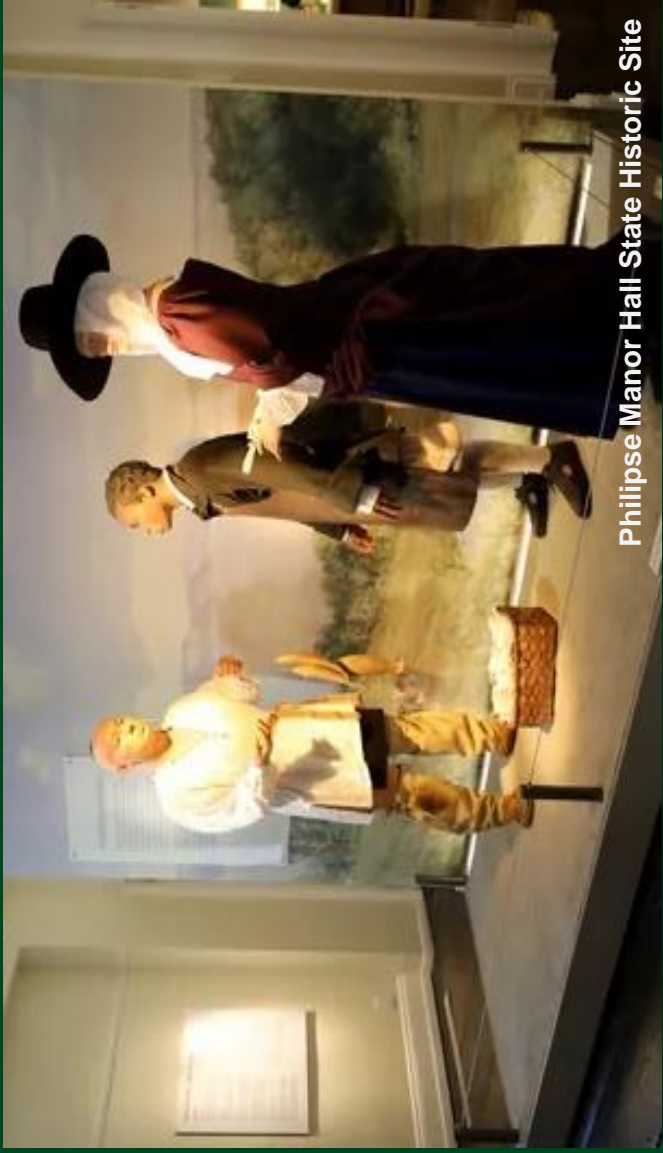
Philipse Manor Hall State Historic Site